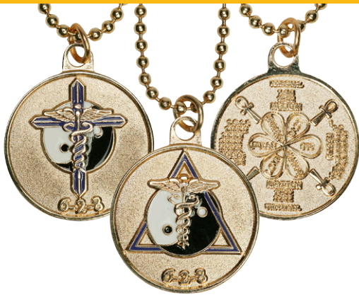
Pendant's diameter is 7/8"

REDUCES: Stress, Anxiety, and Negative Effects of EMF IMPROVES: Vitality, Wellness, Strength, and Performance