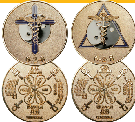
Medallion's diameter is 1 1/2"

Maximize the Benefits of The Power of 3 with 1 Bio-Harmonizer Pendant and 2 Bio-Resonator Medallions